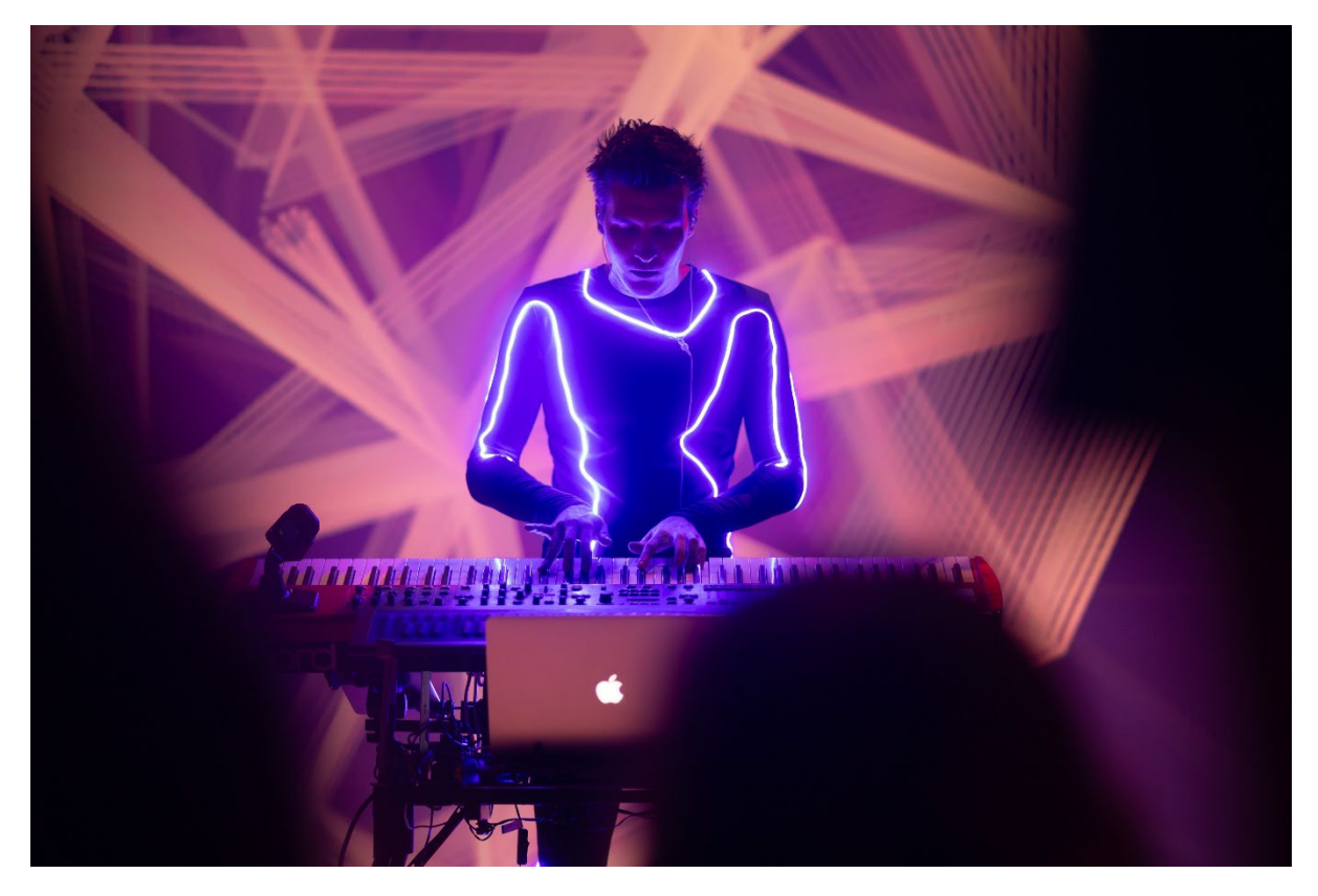
5 Visionary music (core research question is how to develop and design visual musical instruments) by Gerald Peter Ars Electronica Festival

Moreover, we need satellite structures, such as this Community of Practice that bring together different people with their various methodologies and value systems but it can also start devising courses that we can present to universities to be taken on their schedules.