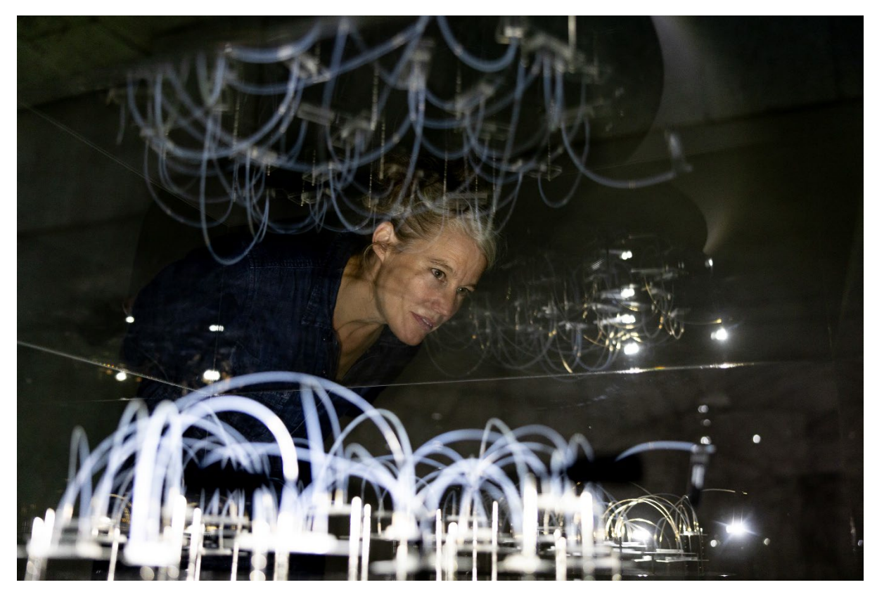
4 Microfluid Oracle Chip & Autopoesis Answering Machine (MOC&AAM) by Agnes Meyer-Brandis (Ars Electronica Festival)