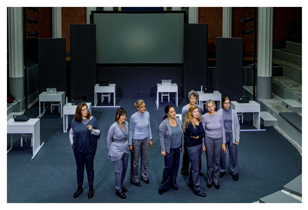
2 JRC Scientists performing