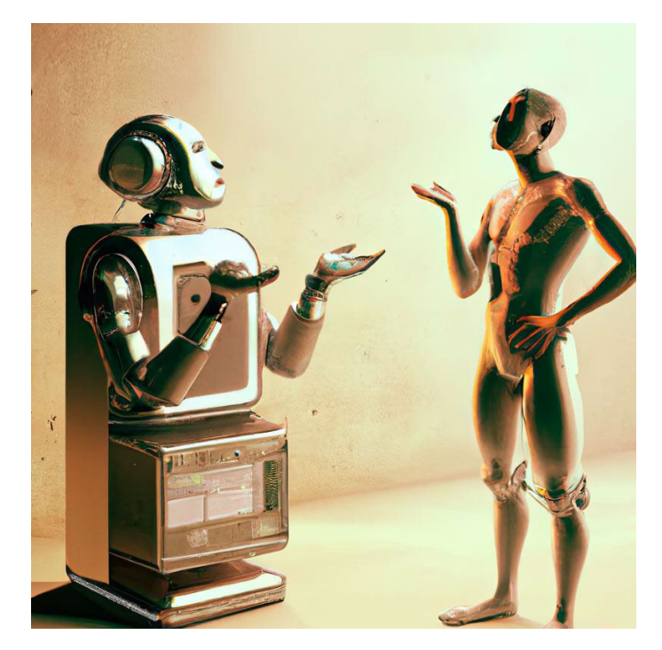
9 The logo of 2023 ARS Electronica Festival in Linz